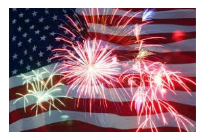
Printed by Labelcraft Press, Inc.

\uparrow \\ \leftarrow \text{ NEW ADDRESS LABEL POSITION} \rightarrow \\ \downarrow